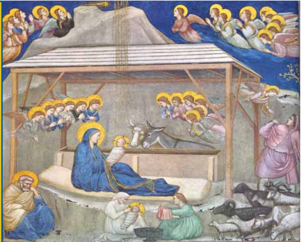
Fresco, "La Natività" by Giotto, Lower Basilica of St. Francis, Assisi

ST. BONAVENTURE SECULAR FRANCISCANS ✕ DETROIT, MICHIGAN