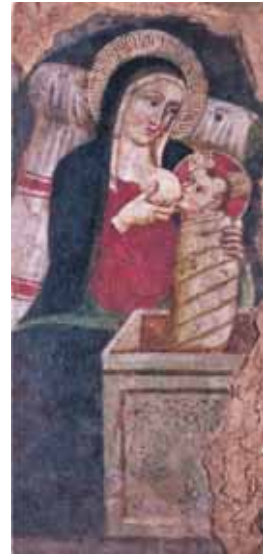
Detail of the 14 th -Century fresco in the Grotto of the Crib Greccio (Rieti), Italy

This, then, was Francis’ Nativity celebration; it had no connection with the Nativity plays and dramas in that he did not impersonate anyone, nor did the priest or brothers. There were neither the traditional figures nor dialogues, and there may or may not have been a figure in the manger. Nevertheless, the Nativity of our Lord was realized that night as fully as perhaps it ever can be. The love, the devotion, the concentration of each individual became one with that of Francis, and in Sabatier’s words: “he was no longer in Greccio; his heart was in Bethlehem.”