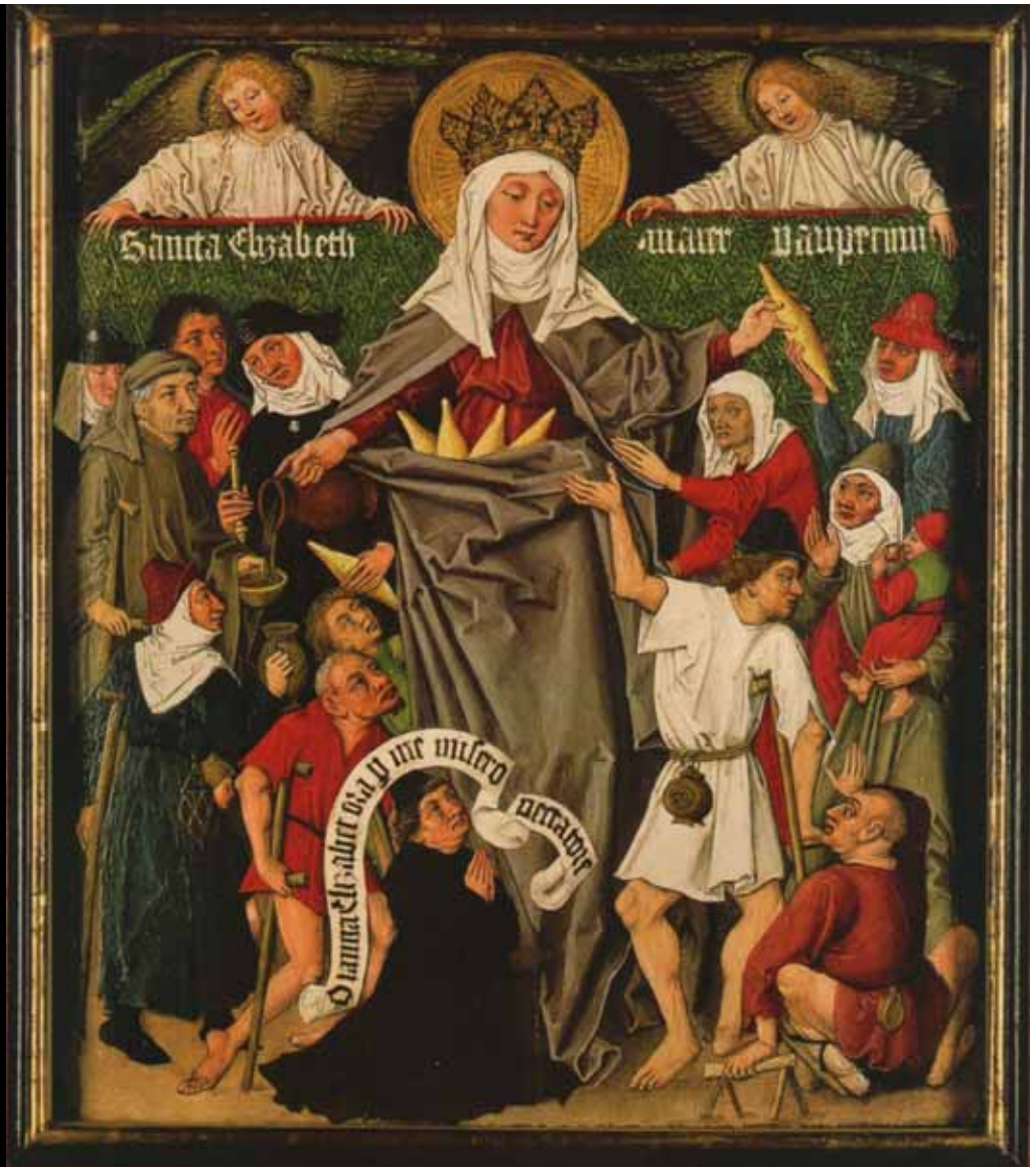
“St. Elizabeth, Mother of the Poor,” by the Master of the Gewandstudien: Elizabeth-Triptychon (cut), from 1480, in the Staatlichen Kunsthalle in Karlsruhe

ST. BONAVENTURE SECULAR FRANCISCANS ✠ DETROIT, MICHIGAN