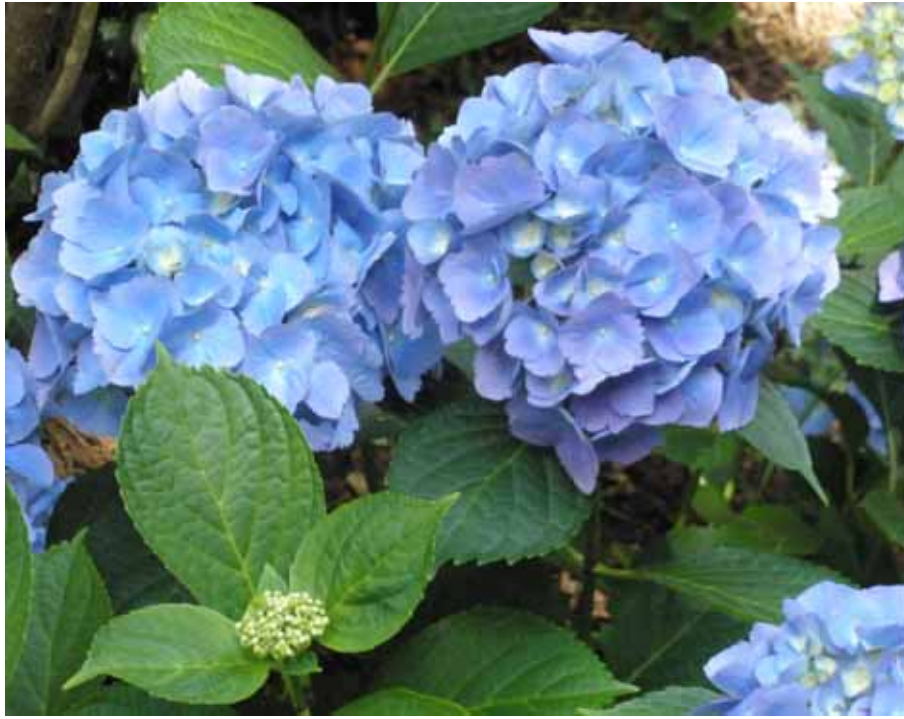
Flowers by God.

St. Bonaventure Secular Franciscan Fraternity 1780 Mt. Elliott St. Detroit, Michigan 48207