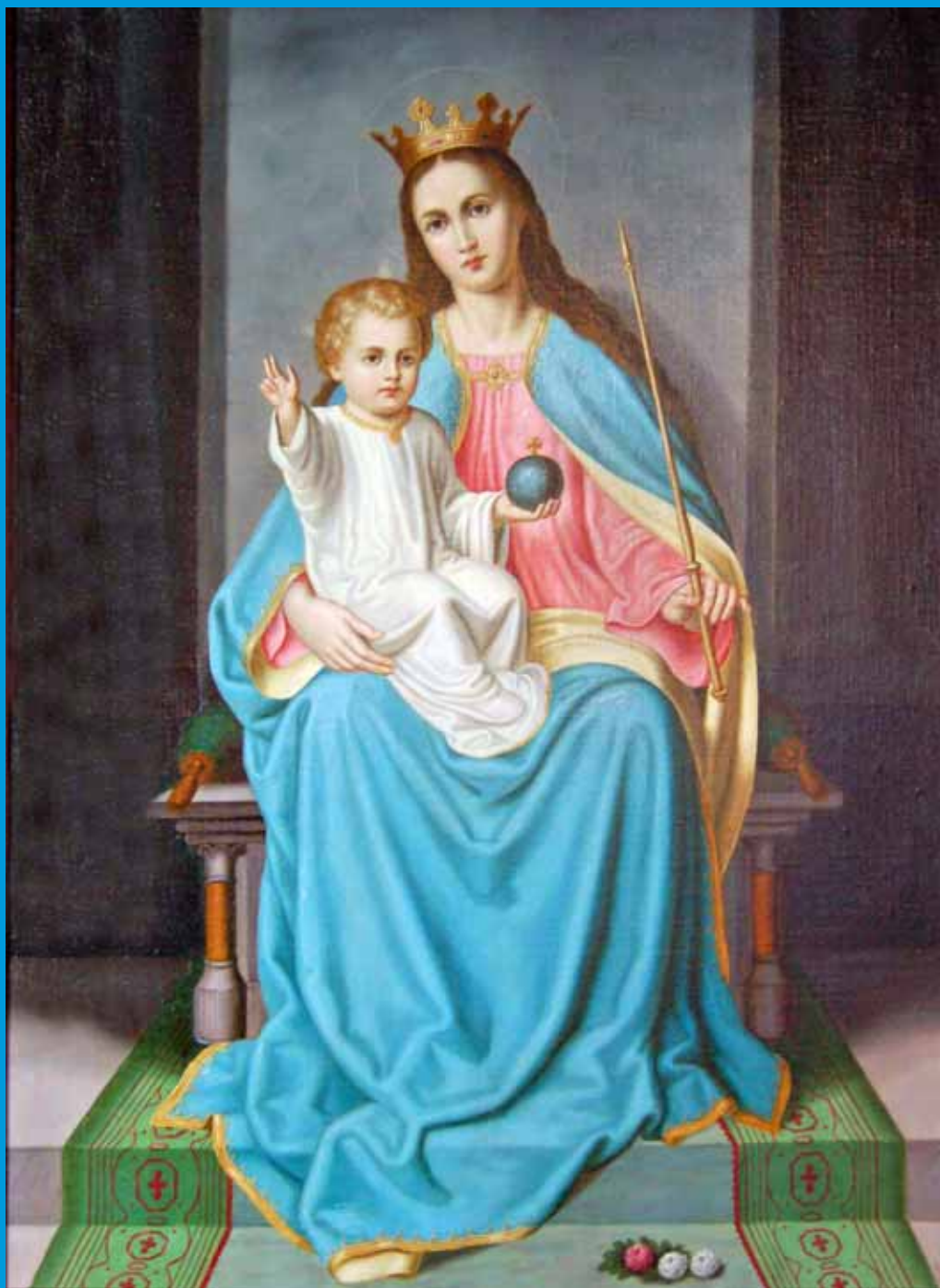
unknown European artist, mid-1800's St. Bonaventure Monastery, Detroit (originally at St. Elizabeth's, Milwaukee)

ST. BONAVENTURE SECULAR FRANCISCANS ✕ DETROIT, MICHIGAN