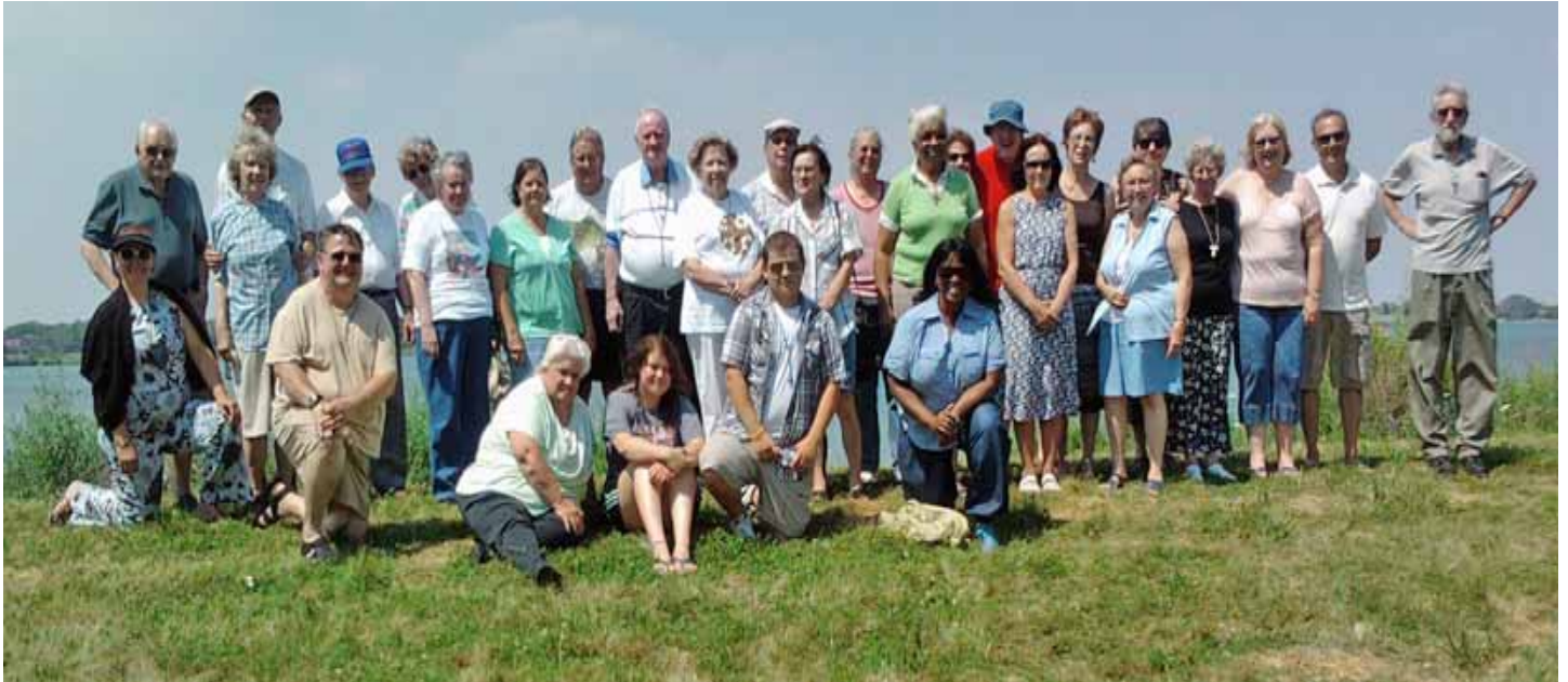
Fraternity Picnic on Belle Isle, July 2011