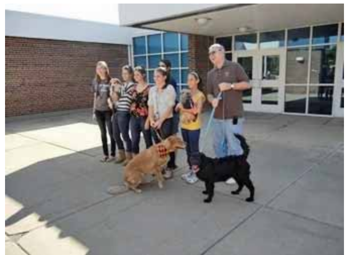
The Blessing of Animals